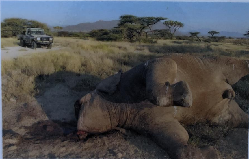
Philo Corpse Philo, five days later. He was shot by poachers and left to rot, his tusks hacked off.